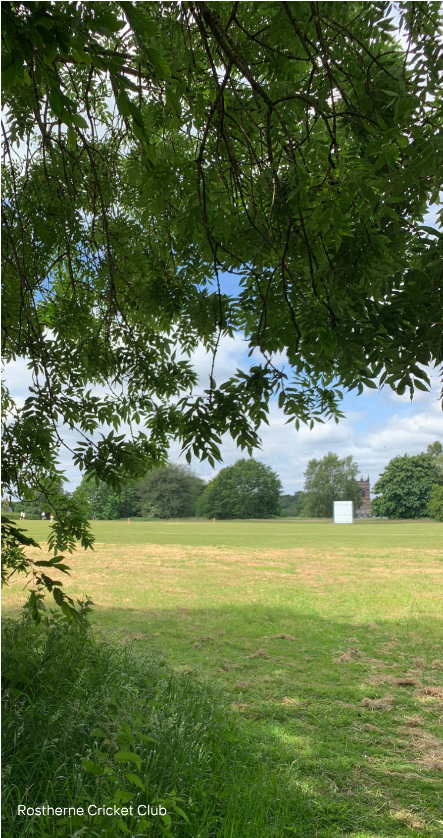
Rostherne Cricket Club

Produced by The Tatton Estate If you would like to feature in future issues, or if you have any questions please contact info@tattonestate.com