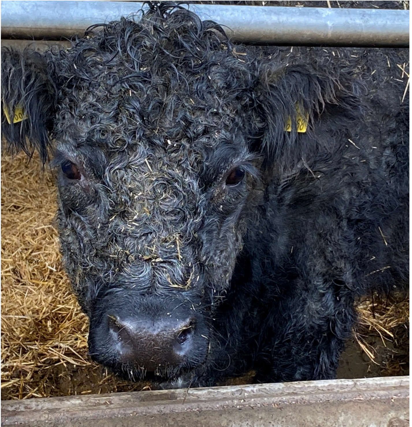
WESTMORLAND CATTLE